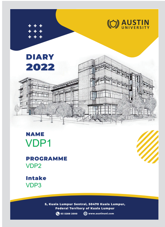
Page 1: Printing Artwork + VDP Identity & Location