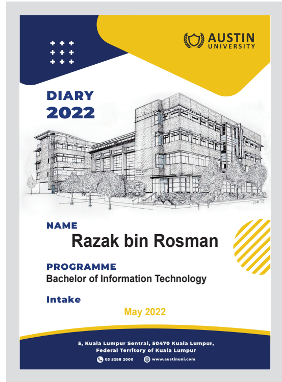
Page 2: Sample Artwork (VDP color depend on order color)