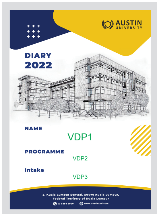
Page 1: Printing Artwork + VDP Identity & Location

VDP1 (Center) + VDP2 (Center) + VDP3 (Center)