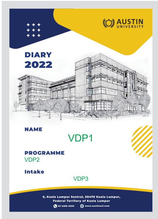
Page 1: Printing Artwork + VDP Identity & Location (VDP color have to in Green color)