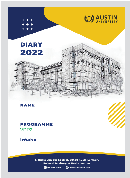
Page 1: Printing Artwork + VDP Identity & Location (VDP color have to in Green color)