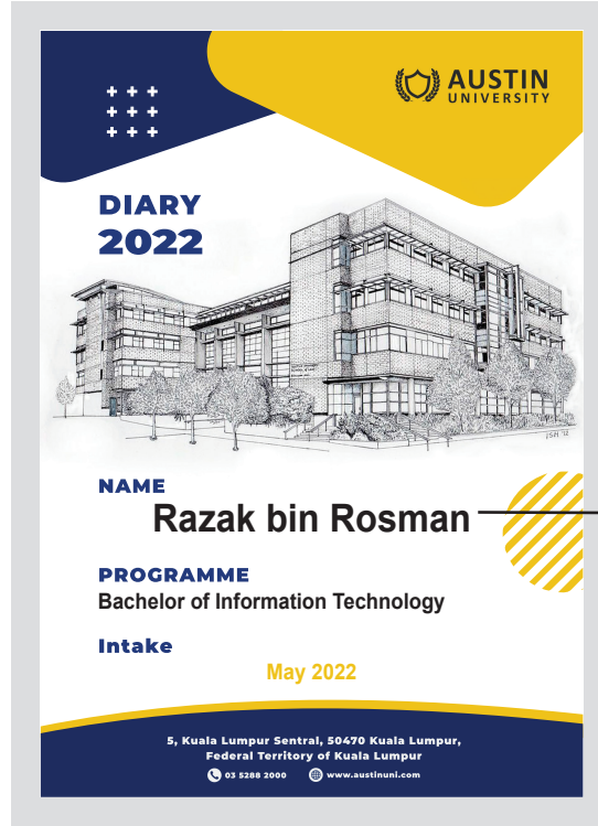
Page 2: Sample Artwork

Put the longest VDP number & text in the space and within safe zone to make sure the artwork outcome can printed out.