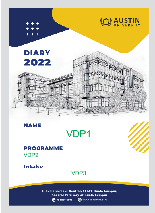
Page 1: Printing Artwork + VDP Identity & Location

VDP1 (Center) + VDP2 (Left) + VDP3 (Center)