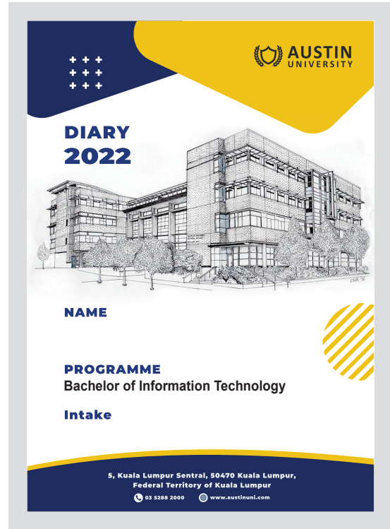
Page 2: Sample Artwork (VDP color depend on order color)